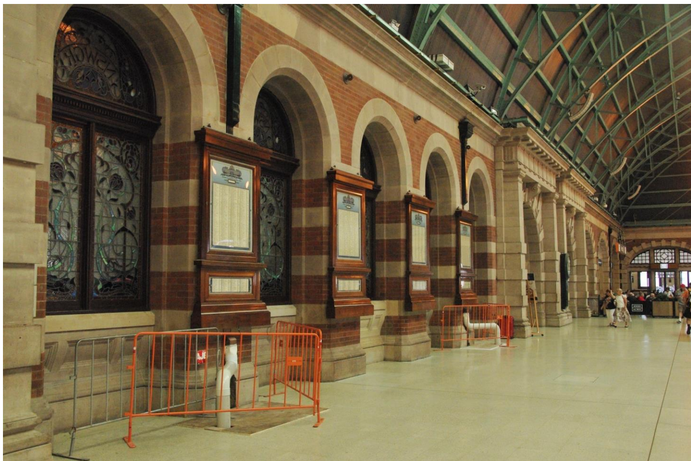
NSW Government Railways & Tramways Roll of Honour